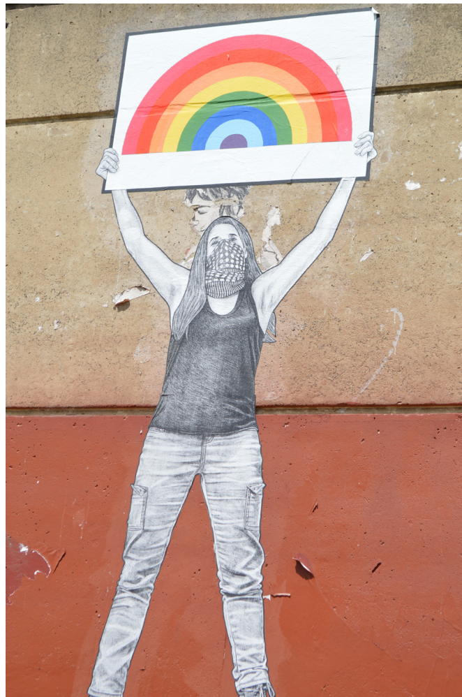
Figure 1: Public Mural

Welcome to the second edition of the Journal of Public Pedagogies . At the time of writing this editorial in Melbourne, Australia we are immersed in a public debate on same sex marriage as the Government conducts a postal vote on this 'issue'. It has been hard to escape the publicness of opinion and the association of the 'right' to marry as argued as a threat to heterosexuality and the demise of the nuclear family. Specifically, the idea that being Gay will be become so 'normalised' it will be encouragingly taught about in schools. The argument stops just short of the statement 'they are going to teach you to be gay'. I would argue for strong resistance to public rhetoric designed to further 'other' marginalised people such as the LGBTQI community. What this debate has crystalized, among other things, is the necessity and problematics of knowledge constructions outside and inside of formal institutions. As people engaged in the theories and practices of public pedagogies we are called on to think about where knowledges reside and who is determining of what knowledges are valued. Constructions of knowledges are never neutral despite how benign they may appear.