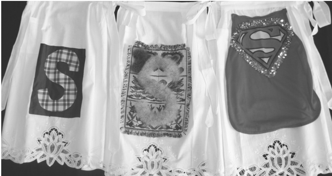
Figure 14: Three (3) aprons for Chisholm's Homes

Examples of 'Apron Stories' below, that accompanied the aprons, highlight the sentiment of this project (Peitsch, 2005):