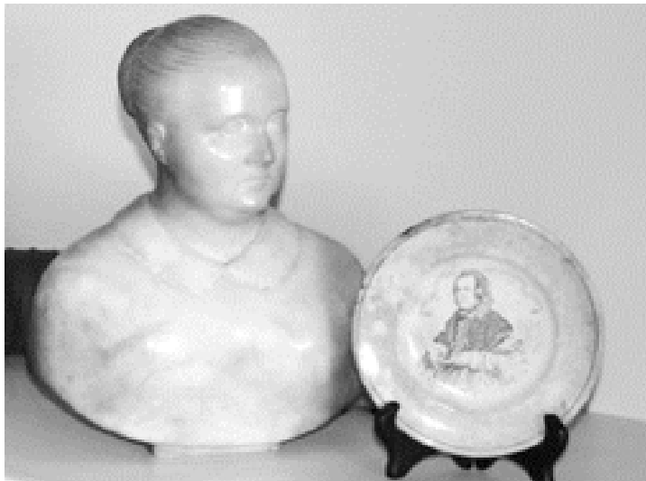
Figure 10: Chisholm’s portrait bust from the Pope, and a small plate entitled ‘The Emmigrant’s Friend’

The drawing is in the possession of her direct descendants who live in Sydney. It seems obvious that the Australian Government should be making efforts to acquire this drawing and the other Chisholm artefacts—a wedding clock, a personally autographed Bible, a book of Memoirs, her design of the ‘Caroline Chisholm’ tall ship, her portrait bust from the Pope, and a small plate entitled ‘The Emmigrant’s Friend’—as significant to Australia’s history, awaiting public attention and viewing. However, to date no indication of this procurement is forthcoming.