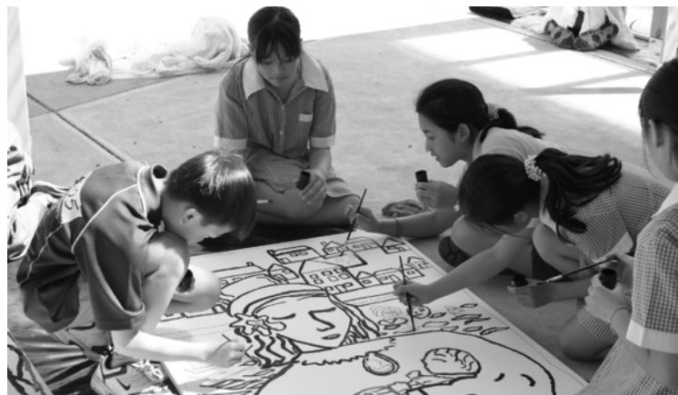
Figures 2: Samples of Chisholm's Homes Projects