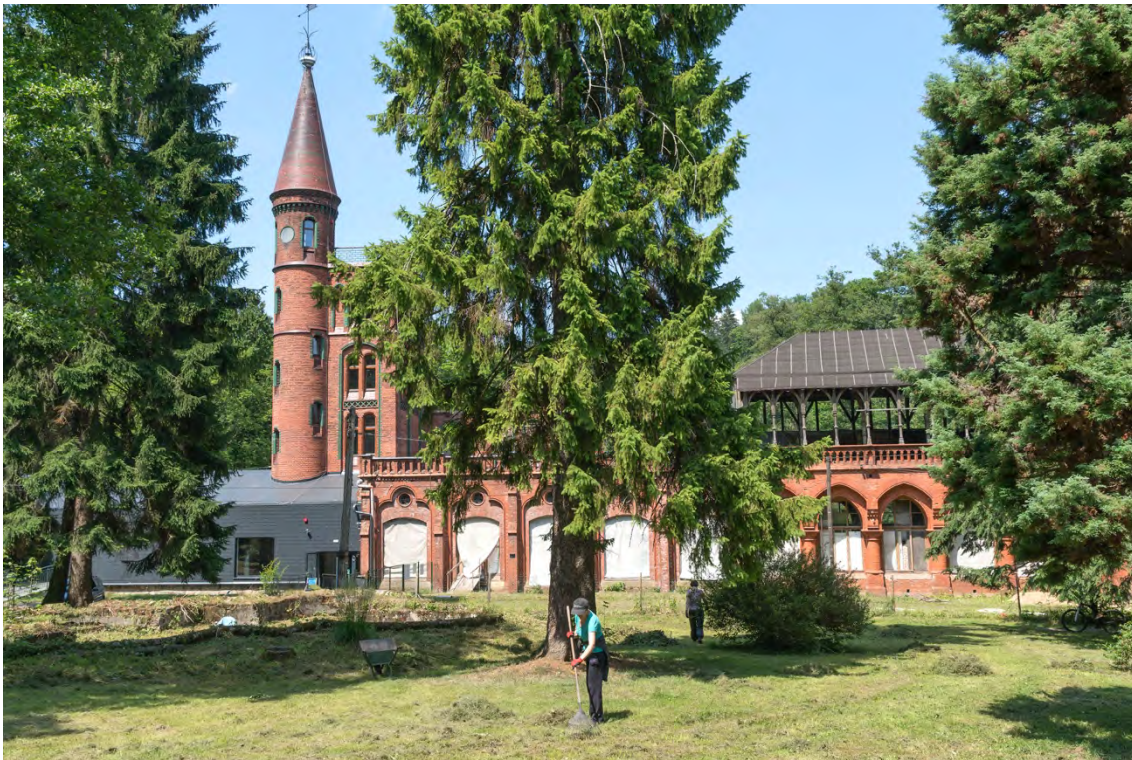
Figure 1: Sokołowsko Sanatorium, Poland, 2017.

On July 23, 2017, artists Robert Bean and Barbara Lounder, the authors of this paper, presented an artwork in the form of an annotated walk that explored breathing, the phenomenology of weather, and the politics of climate change. The walk was commissioned by Festival CONTEXTS 2017: International Sokołowsko Festival of Ephemeral Art . The site-specific, interactive artwork responded to the contingencies of the nineteenth-century sanatorium in Sokołowsko, Poland as a site of healing as well as a geography of deadly conflict. Established by Hermann Brehmer in 1854, the sanatorium in Sokołowsko was the first centre in Europe for the climatic treatment of tuberculosis and was a significant precedent for sanatoriums such as Davos, Switzerland, which was the location of The Magic Mountain novel by Thomas Mann. In Bean and Lounder's interactive project, allegorical and literary references to the history of breathing, atmosphere, weather, conflict and healing were incorporated into the collective experience of walking at this unique site. Being-in-the-Breathable was an annotated walk with 80 participants, which unfolded as a 90-minute walk along 2km of the paths of the sanatorium grounds.