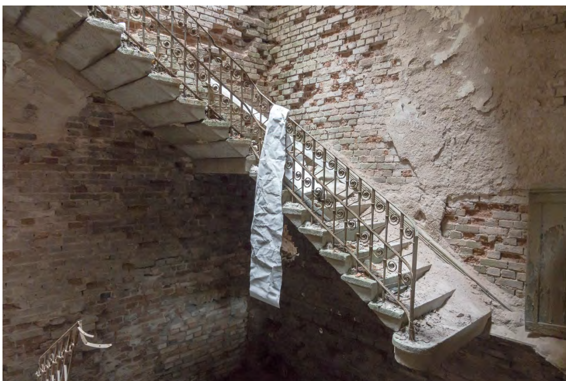
Figure 2: Sokołowsko Sanatorium, Poland, 2017.

Due to the chronic pulmonary pathology of tuberculosis, natural climatic treatment in elevated quarantined atmospheres was presumed to be of medical benefit to the patients. Prior to the twentieth century, sanatoriums functioned as luxurious spas as well as infirmaries. Access to many of these sanatoriums was based on wealth and status. Franz Kafka hoped to go to Sokołowsko for treatment but was unable to afford the expense. The sanatorium in Sokołowsko featured 300 beds, open-air terraces with chaises longues, hydrotherapy, an observatory, a visitor's guesthouse, and gardens for strolling. It was not until the advent of X-rays, antibiotics and other medications that tuberculosis would be contained. The Sokołowsko sanatorium is currently being restored by the In Situ Contemporary Art Foundation to function as a cultural centre for arts festivals and symposia.