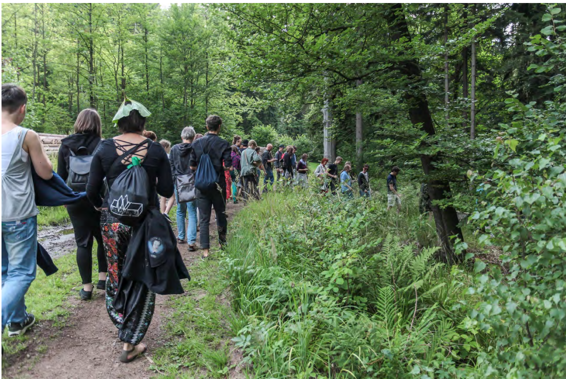
Figure 7: Walking, 2017.