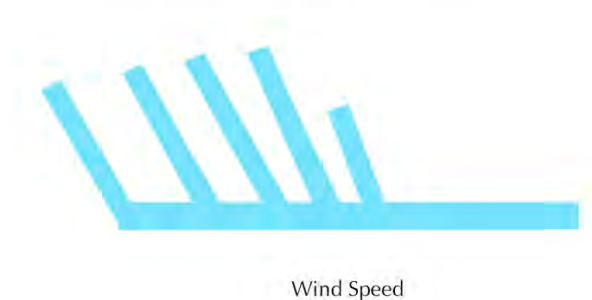
Figure 8: Event Score: “Contagion and the Commons; up in the air,” 2017.

Rebecca Solnit, Victories against Trump are mounting. Here's how we deal the final blow . The Guardian , June 18, 2017