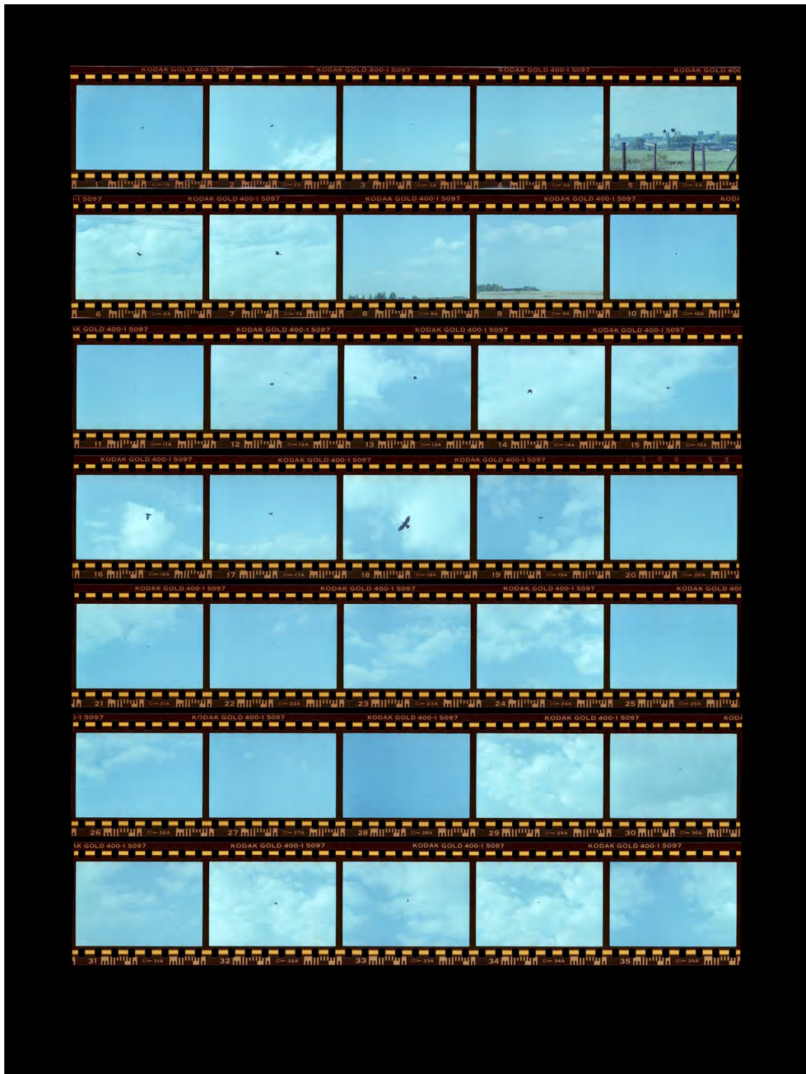
Figure 16: Sokotowski Sanatorium Installation: “Majdanek Concentration Camp, 1988” (2017).

Engaging in diverse modes of research-creation and experiential learning, the route for the walk was created through two days of wandering and exploration on the grounds and in the landscape surrounding the sanatorium. The event score, composed of actions and annotations, was prepared in advance in response to the Sokołowski sanatorium as a historic site for climatic and atmospheric healing. The score was left unpaginated and unbound so that