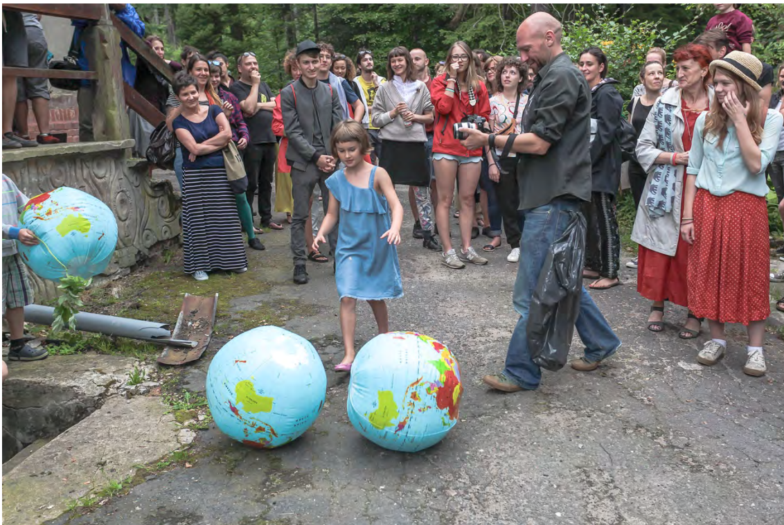
Figure 9: Contagion and the Commons: walking event, 2017.