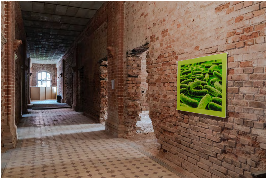
Figure 12: Sokolowsko Sanatorium Installation: "Tuberculosis", 2017.