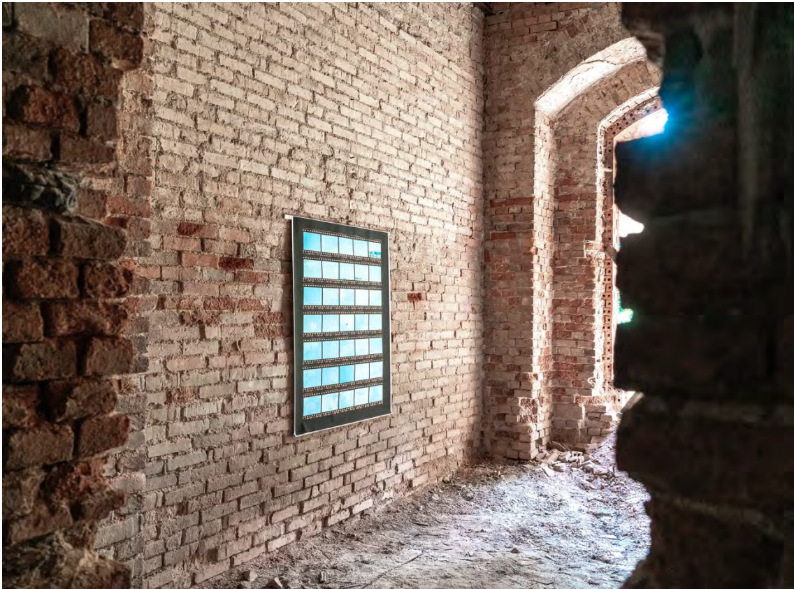
Figure 14: Sokolowsko Sanatorium Installation: “Majdanek Concentration Camp, 1988” (2017).