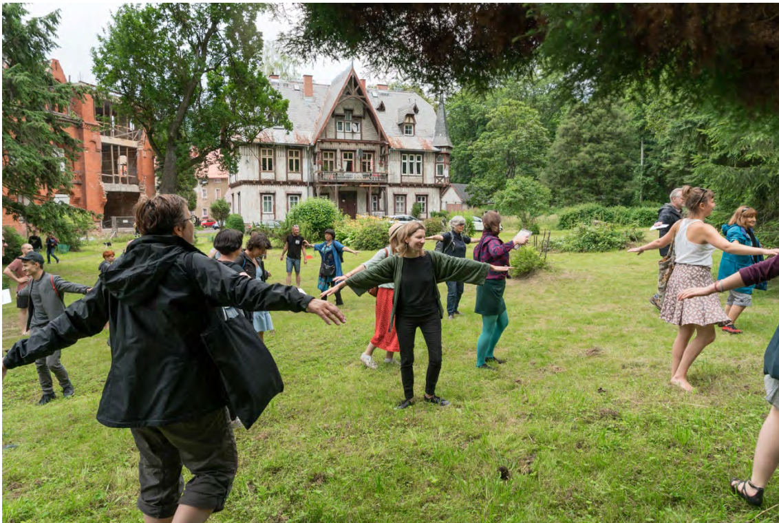
Figure 4: Quarantine: walking event, 2017.

Keeping the quarantine space described by extended arms, participants then walked across the lawns of the main sanatorium building, stopping in the shade provided by a grove of mature trees to consider breathing as a simple ‘respiratory economy’ of inhalation and exhalation. First, the participants were instructed to hold their breath for as long as possible, and the question of who controls respiration was posed. Then, standing face-to-face, partners performed a sequence of synchronous inhaling, exhaling and humming. This action created an awareness of the interface of inside and atmosphere that happens in breathing.