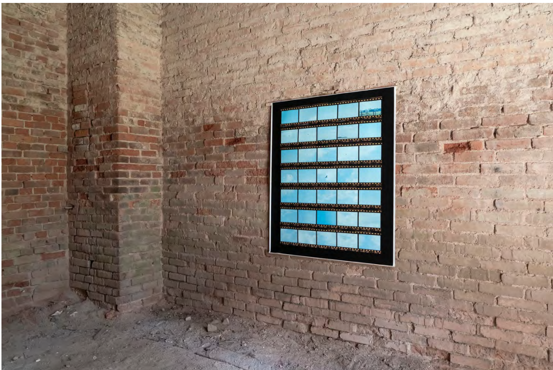
Figure 15: Sokolowsko Sanatorium Installation: “Majdanek Concentration Camp, 1988” (2017).