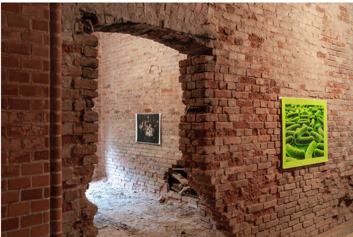
Figure 13: Sokolowsko Sanatorium Installation: "Tuberculosis" and "Bird in an Air Pump", Joseph Wright of Derby (1768,) 2017.