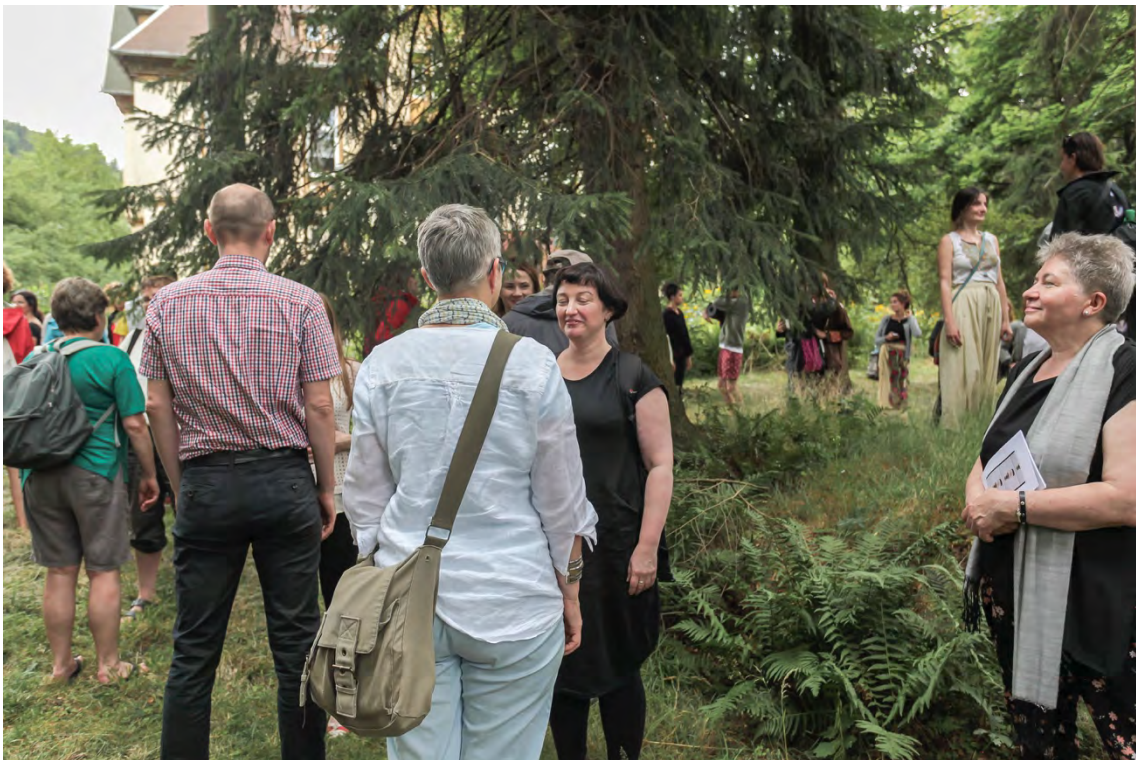
Figure 6: Air Memories: walking event, 2017.