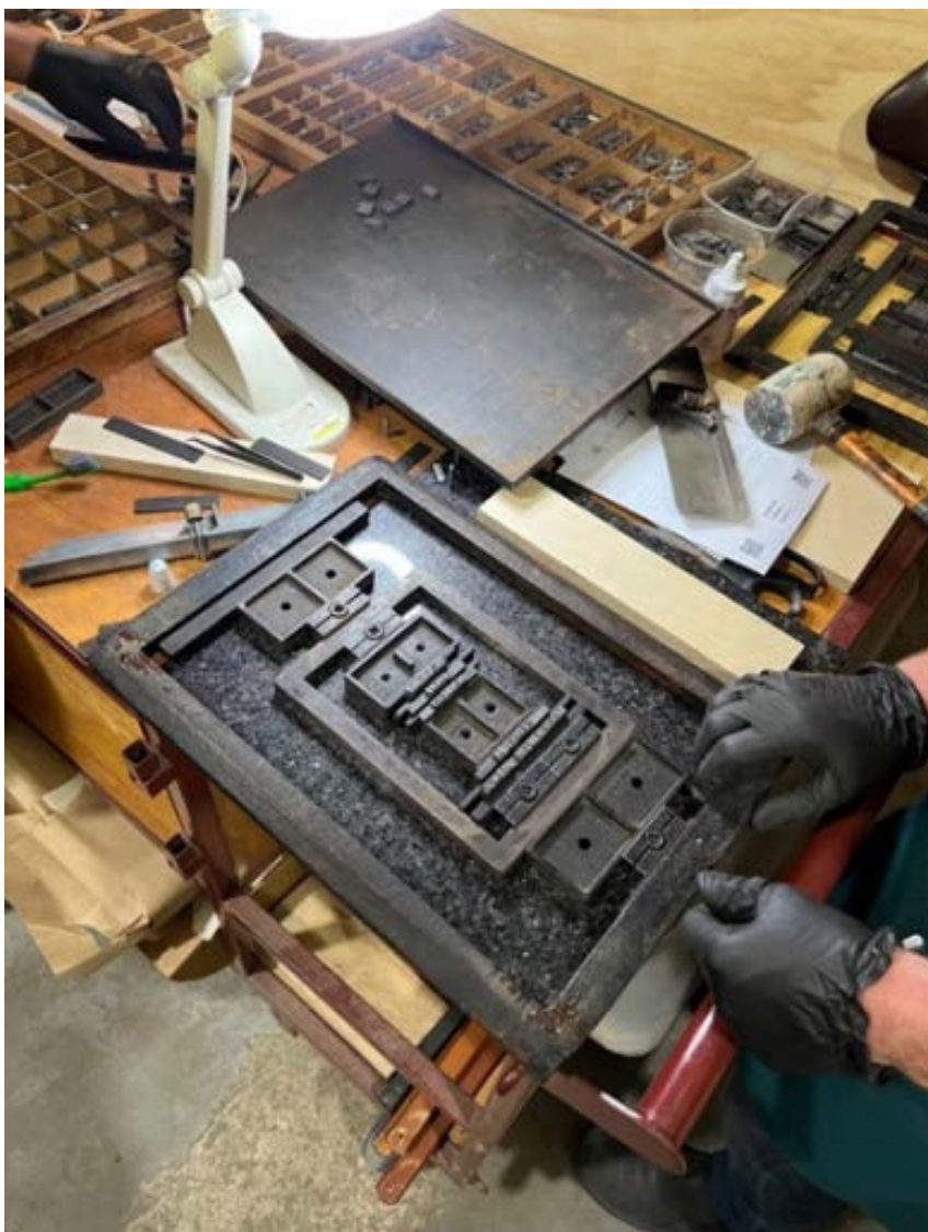
Figure 1. Typeset forme, with moveable type, furniture, quoins and chase.

Along with the letterpress machines and a large industrial guillotine, Commoners Press also purchased more than twenty typefaces in metal ‘movable type’. These typefaces are the mechanism through which text was prepared for printing prior to early twentieth century mechanisation, and then later, digitisation of the process. Individual ‘movable type’ letters are combined one by one to form words, after which word spaces are added and combined with images or symbols to create a complete printing block or ‘forme’. The metal and wooden components are ‘locked-up’ in a ‘chase’ with ‘quoins’ and other typesetting ‘furniture’ to create the rigid printing forme.