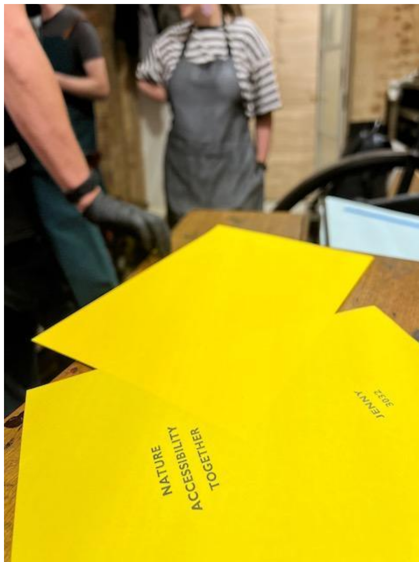
Figure 4. these three words printed outcome during workshop.

One participant expected that their three words would be brought into deliberate discussion and critique, perhaps in order to generate a consensus or agreed future aspiration for the group. However, whatever words were chosen were simply accepted, and Commoners Press operators helped locate typefaces and letters and advised on how to create a stable printable forme.