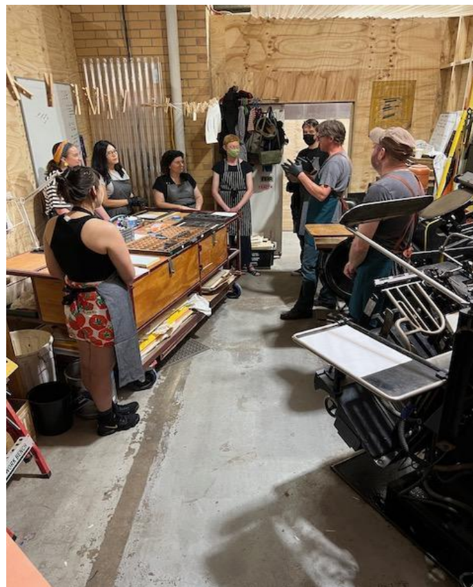
Figure 3. these three words workshop introduction at the Commoners Press.

The project attempted to tackle significant social and complex issues in a somewhat playful manner, allowing participants to air personal aspirations in a group setting and in a supportive and celebratory environment. The highly manual, focussed activity of hunting for letters and arranging them around the right way, and designing the layout for their type would it be ranged-right, centred or situated towards the base of the paper – also distracted from over-thinking or internal criticism. As individual participants typeset their words there were jokes about mis-spelt words and comments about this or that word, but the overriding sense was of a collective collaborative spirit coming to grips with the letterpress technology.