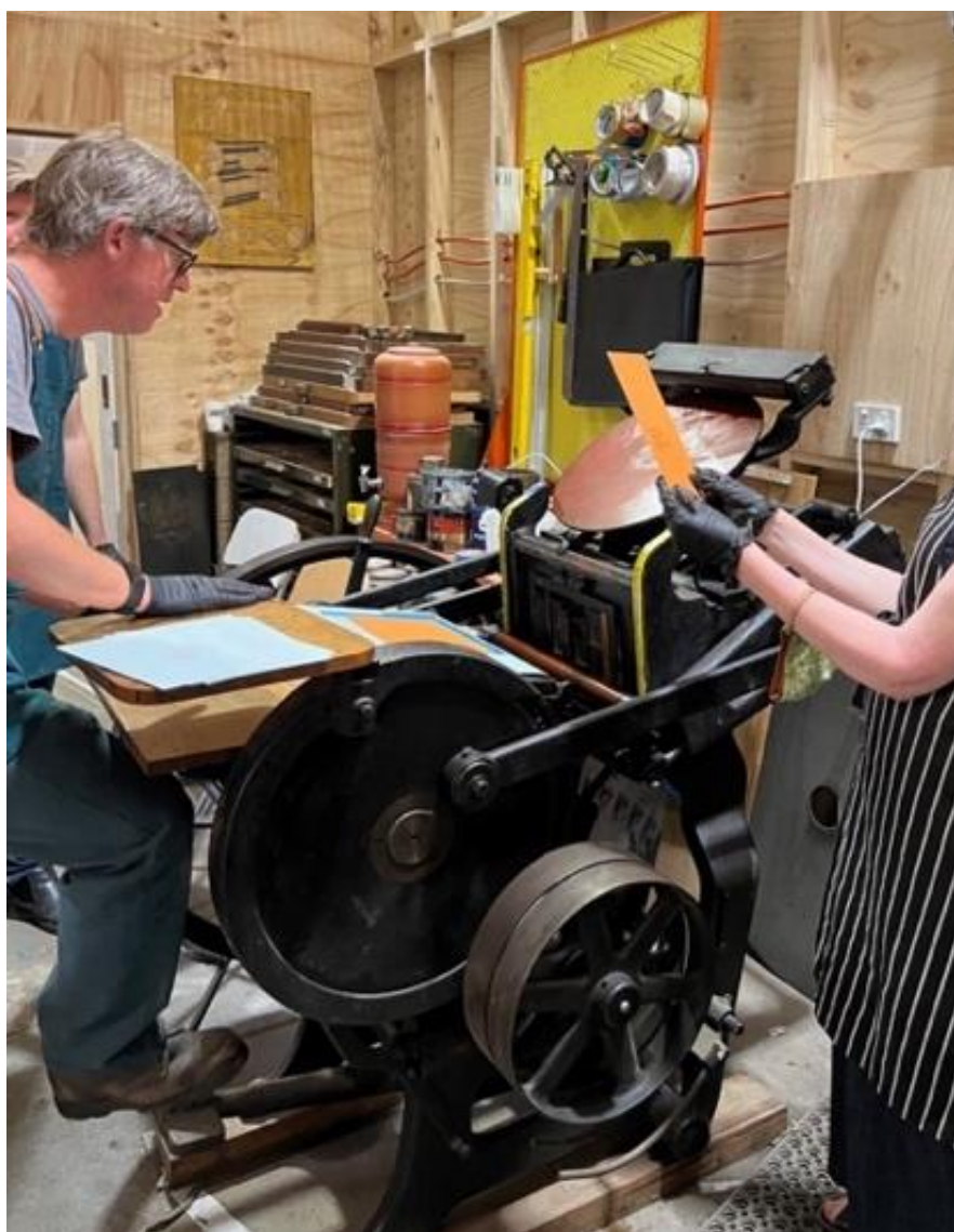
Figure 2. The Chandler and Price letterpress in operation during these three words .

For the Commoners Press operators – who are self-trained and have not completed any lengthy apprenticeships – it is possible to print approximately 50-100 items an hour. During the these three words workshops each participants' forme was printed between 10-15 times.